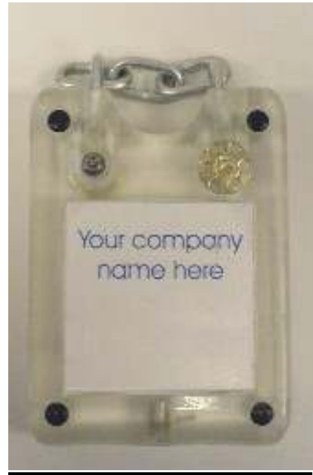
Example of standard skip light