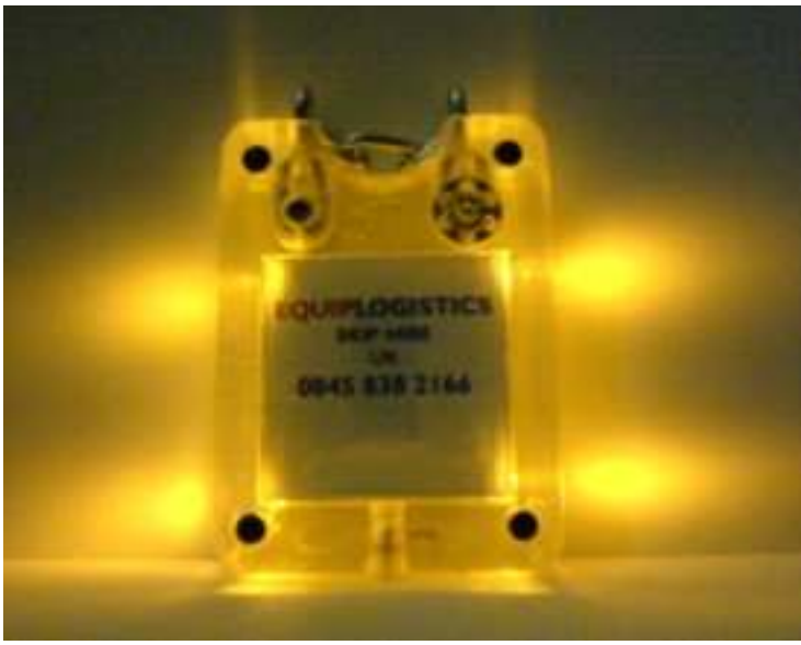
Skip light in operation