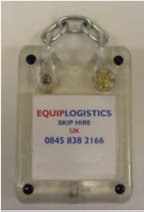
Example of personalised skip light